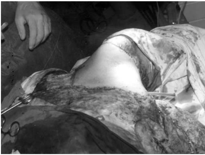
Fig. (7): Immediate post operative with the flap covering the neck defect except small area covered by split graft.