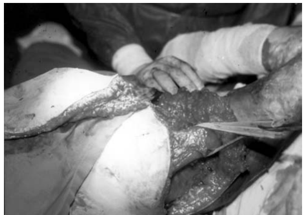
Fig. (4): Intra-operative view after opening the axilla, raising the head of latissimus dorsi near its insertion, tunneling of the flap (just beside the rubber drain). Note: The cuff of soft tissue around the vascular pedicle.