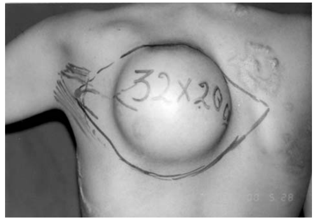
Fig. (2): The same patient showing maximal expansion.