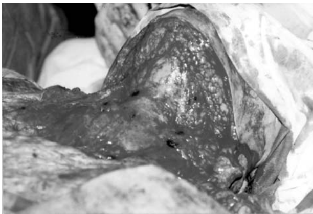
Fig. (3): Intra-operative view after excision of the scarred skin, platysma and neck release.