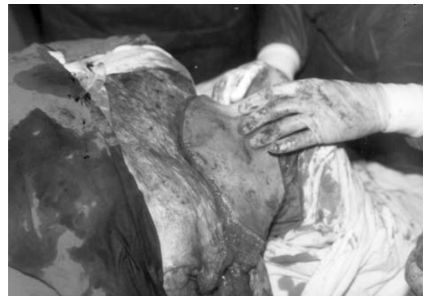
Fig. (6): Intra-operative view with the pre-expanded scapular flap covering the neck defect.