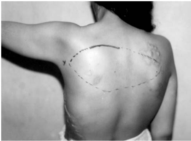
Fig. (1): 30-years old female with post-burn contracted neck the flap is designed (dotted line) and the incision for placement of expander (continuous line).